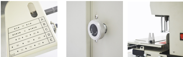
Preset whole patterns