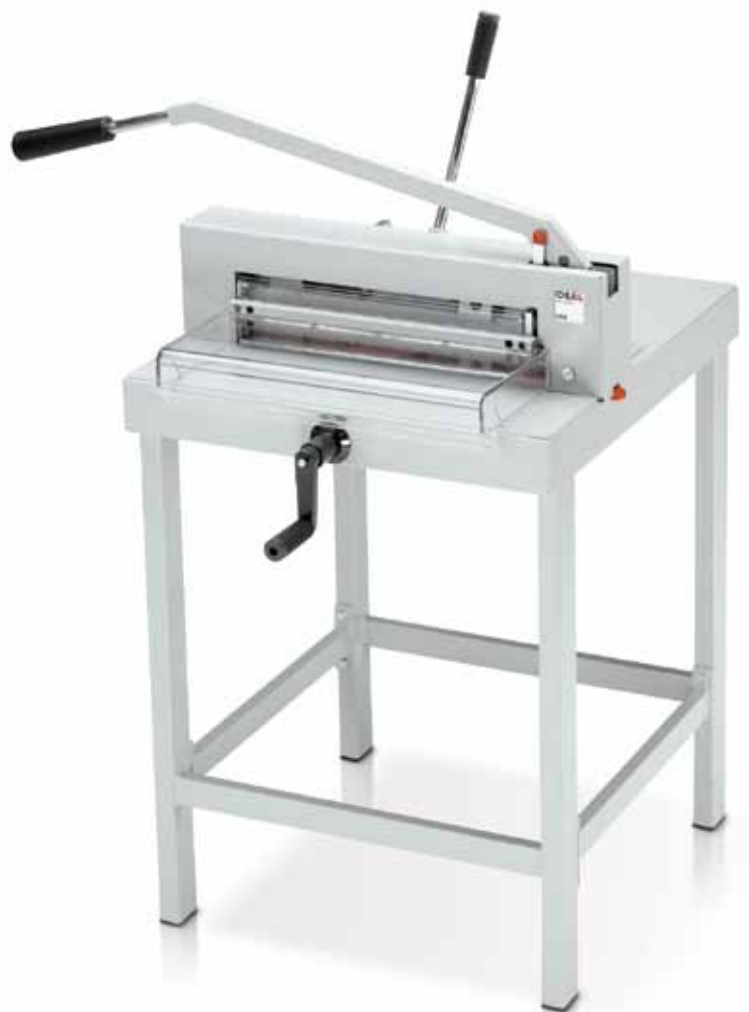
IDEAL 4305 with optional stand